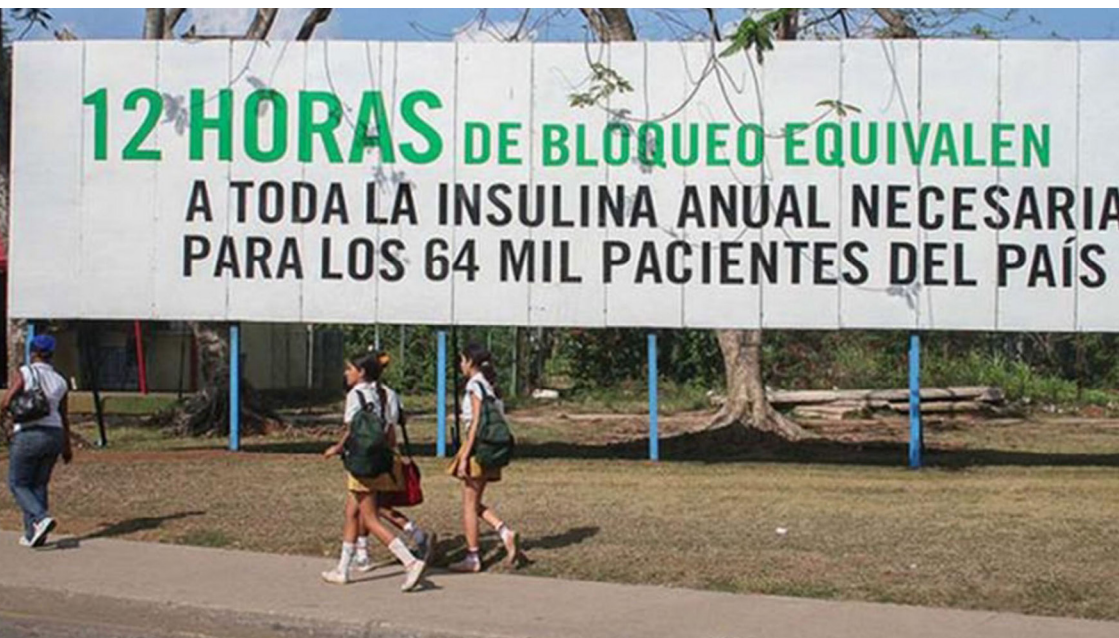
A billboard reads: Twelve hours of blockade is equal in cost to all the insulin needed to treat the country's 64,000 patients for a year

Today, these achievements are under threat. A combination of the COVID-19 pandemic, the global economic crisis, climate change, and 243 extra sanctions imposed by the Trump administration, including Cuba's inclusion on the US State Sponsors of Terrorism (SSOT) list, have taken a terrible toll on the health service.